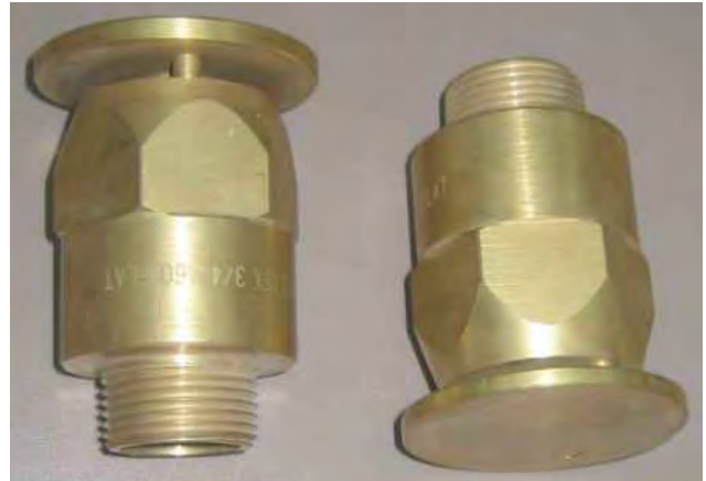
WILTEX 360 FLAT

The minimum desirable pressure to achieve a reasonable spray pattern is 1.4 Kg./Sq.cm. The water distribution pattern as shown in the graph in following pages is at an average pressure of 5.0 Kg/Sq.cm. The change in pressure between 1.4 to 3.5 Kg./sq.cm does not affect much change in spray angle. The spray pattern should be in laboratory conditions. Outdoor performance is largely dependent on wind seep, its velocity and direction including field obstruction.