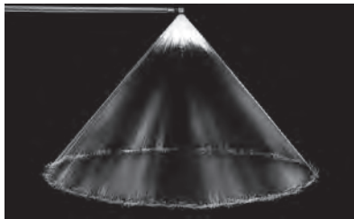
Hollow Cone 90°

Spray pattern :Hollow Cone Spray angle : 90° to 120°