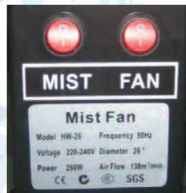
Back panel switch